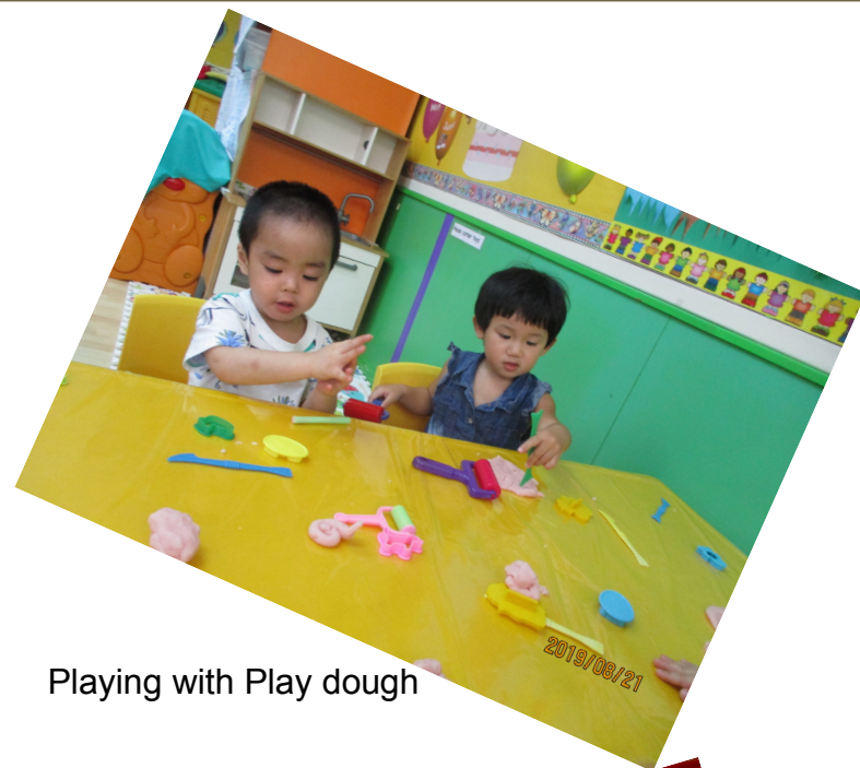
Playing with Play dough