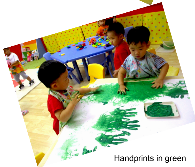
Handprints in green